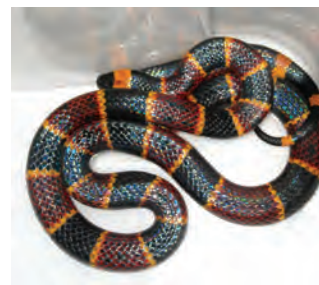
coral snake (venomous)